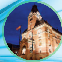
EXHIBIT HOURS: (Estimated)